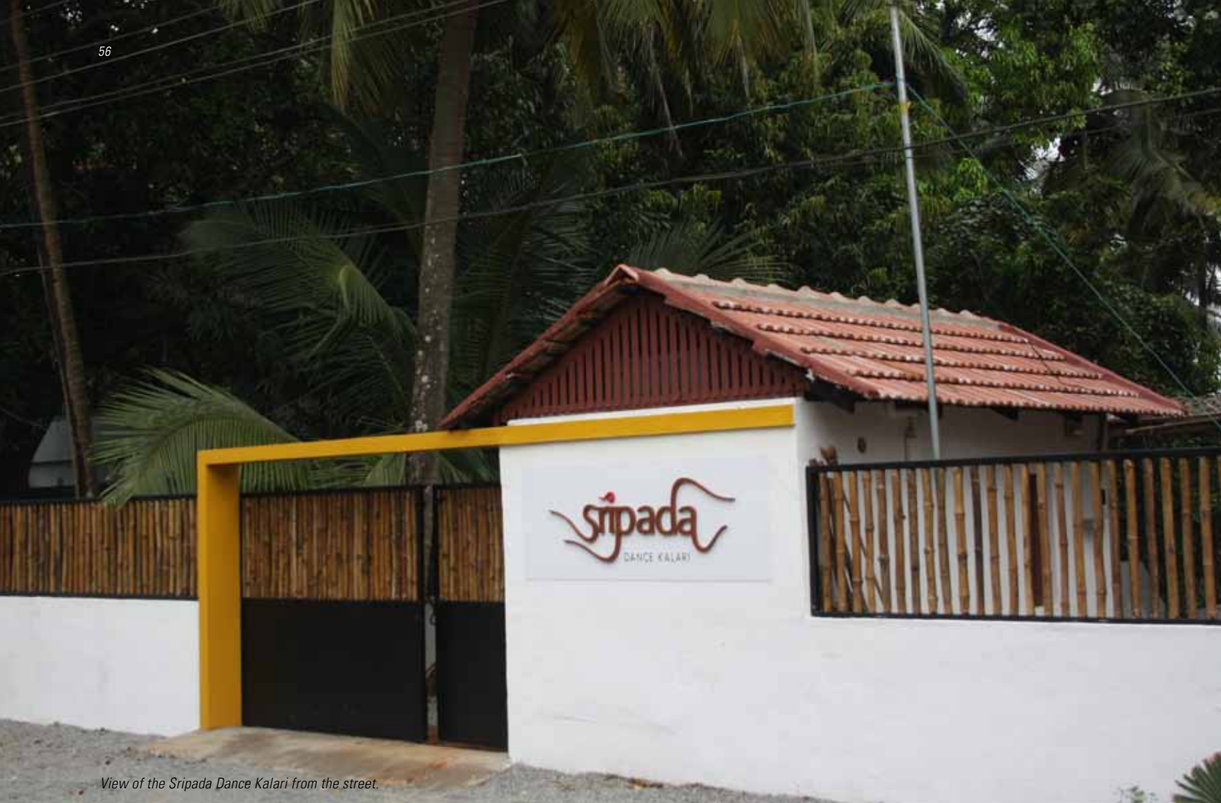
View of the Sripada Dance Kalari from the street.