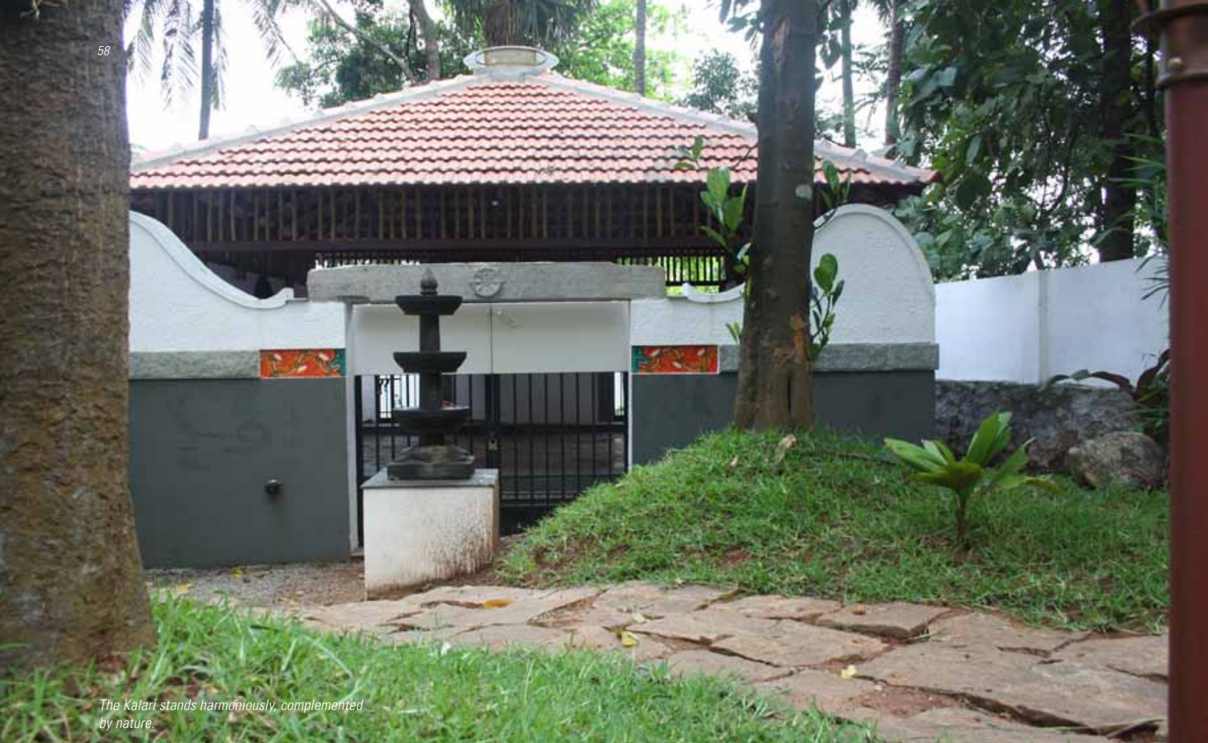
The Kalari stands harmoniously, complemented by nature.