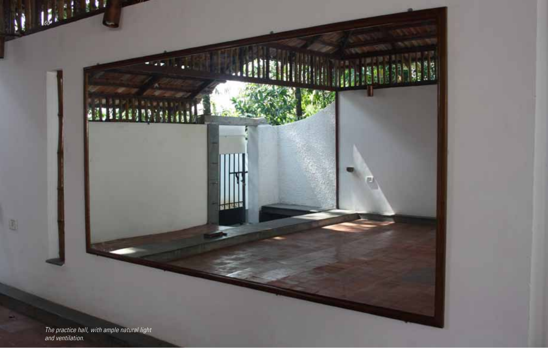
The practice hall, with ample natural light and ventilation.