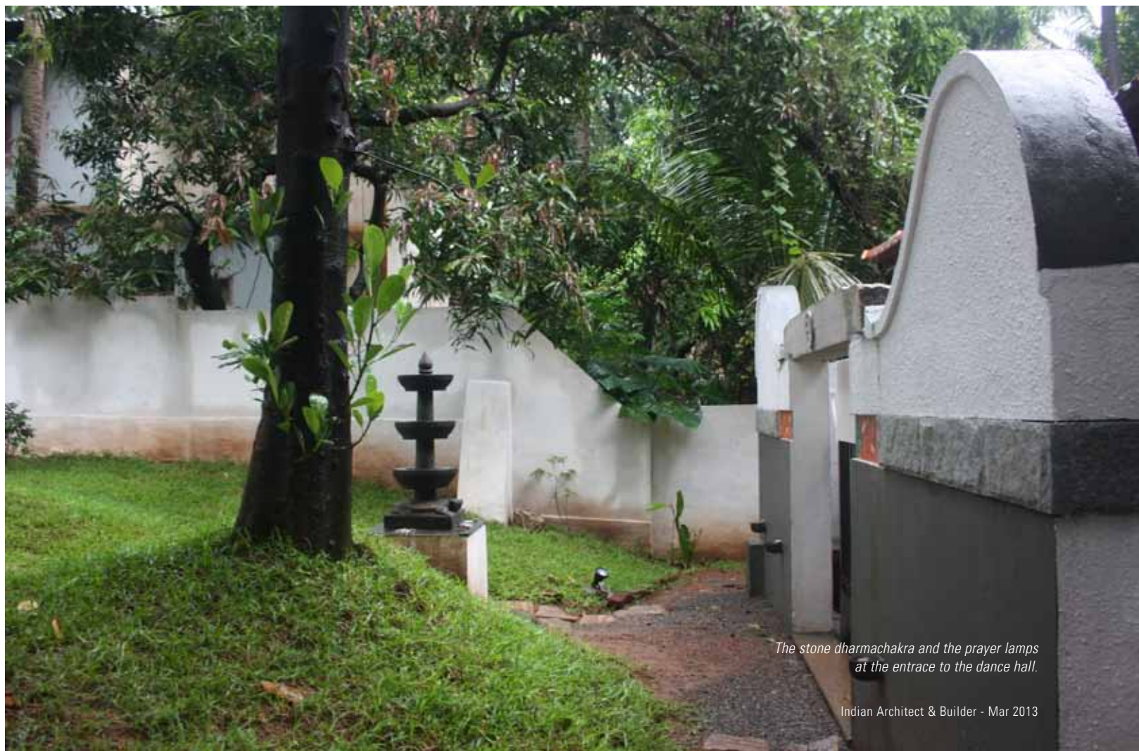
The stone dharmachakra and the prayer lamps at the entrance to the dance hall.