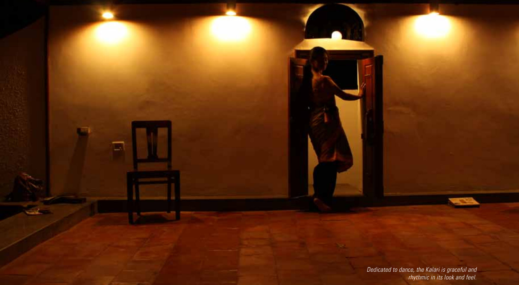
Dedicated to dance, the Kalari is graceful and rhythmic in its look and feel.

hall. The entry to the dance hall is marked with stone lamps, like those at temples, symbolising that the space within is sacred and to be treated with utmost respect. A practice stage is also created in front of the kalari which is actually the foundation of a dilapidated house which was existing in the site. The foundations have been strengthened and restored so that it retains potential for future additions. On entering the structure, a small pebbled court leads to the practice hall. Three small courtyards within the hall as well as a central skylight bring in ample natural light and ventilation; changes in the amount of sunlight create various patterns of light and shade, setting a totally different mood for every performance. The design thus incorporates eco-sensitivity, wherein one can relate to the elements of nature, such as the sun, the rain and the wind that carries the fragrance of the flowering trees in the periphery.