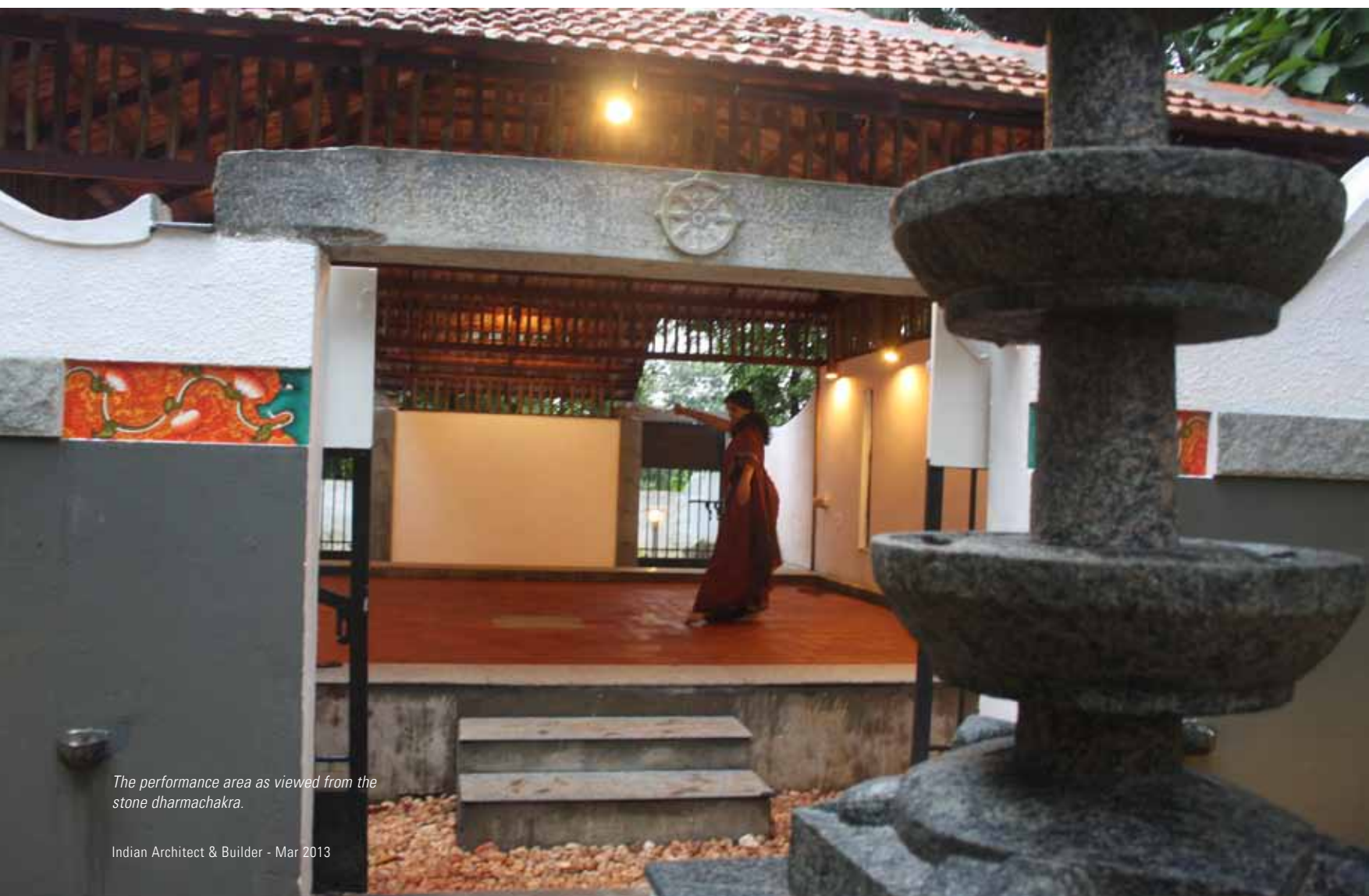
The performance area as viewed from the stone dharmachakra.