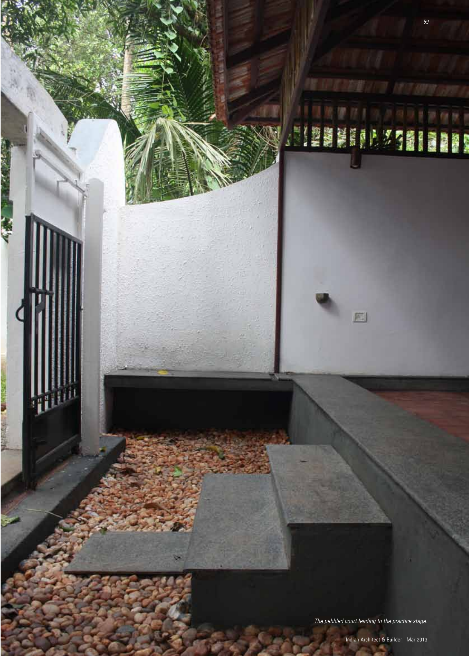
The pebbled court leading to the practice stage.