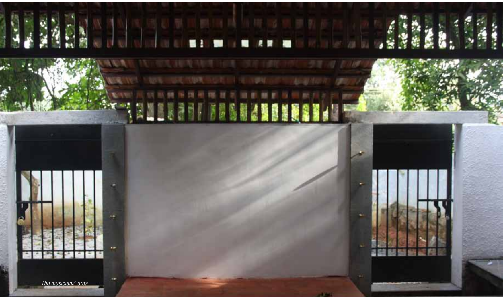
The musicians' area.